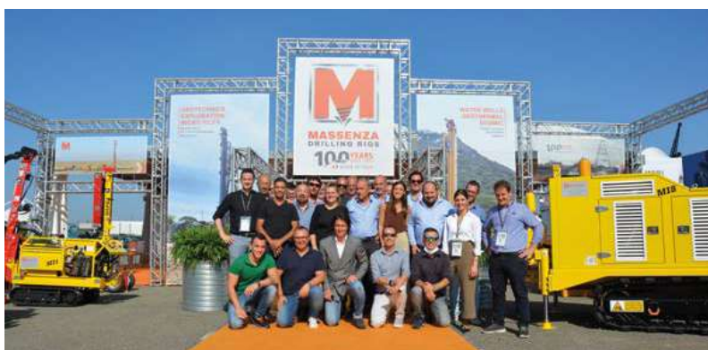
Massenza centred its 100th centenary celebrations around the Geofluid event in its native Italy

As new distributors are added to Massenza's international network they will benefit from the changes that the centenary celebrations brought about. As the company celebrated its 100-year history last year it took the opportunity to renew its brand image – a new logo, a new boost towards the future that keeps firmly the bond with its past. A past that it loves and respects. In addition, new channels of communication were developed including new catalogues, a revised website and increased social media presence.